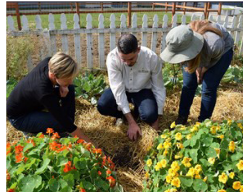
NRCS conservationist assisting small scale farmer with developing a customized conservation plan.

To file a program discrimination complaint, complete the USDA Program Discrimination Complaint Form, AD-3027, found online at How to File a Program Discrimination Complaint and at any USDA office or write a letter addressed to USDA and provide in the letter all of the information requested in the form. To request a copy of the complaint form, call (866) 632-9992. Submit your completed form or letter to USDA by: (1) mail: U.S. Department of Agriculture, Office of the Assistant Secretary for Civil Rights, 1400 Independence Avenue, SW, Washington, D.C. 20250-9410; (2) fax: (202) 690-7442; or (3) email: program.intake@usda.gov .