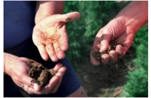
Checking the moisture in soil.