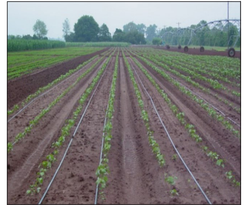
Irrigation water management.

Irrigation water management is a plan to help you know when, how much, and at what rate to apply irrigation water in an efficient manner.