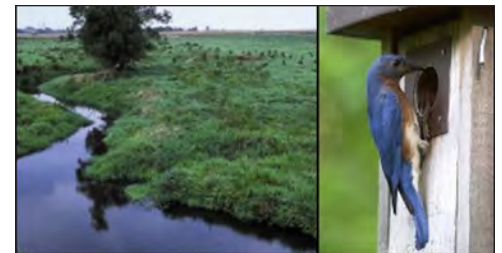
Appropriate wildlife habitat is critical.