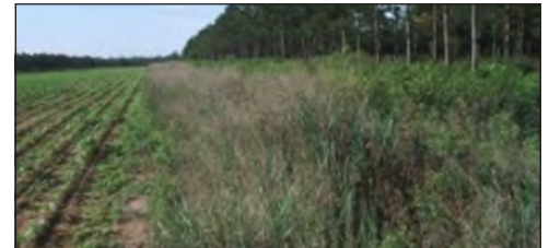
Borders of natural vegetation on field edges provide habitat for beneficial insects.