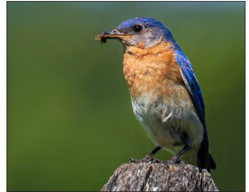
Eastern Bluebird ( Sialia sialis ) with insect.