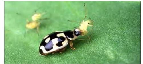
A ladybug eating an aphid.

It is relatively easy to find bat houses to purchase or you can obtain plans, available from many sources to build your own. Houses can be placed on poles, the sides of buildings, dead trees, or other structures. The bottom of the bat house should be 12 to 15 feet off the ground. Place the house in an area where it will receive plenty of sun. Bat houses within a quarter mile of a lake, pond, river, stream, or open marsh have a greater chance for success.