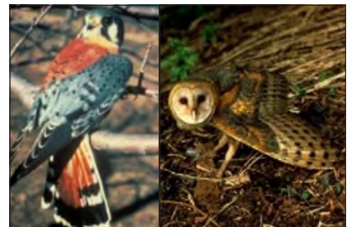
American Kestrel ( Falco sparverius ) and Barn Owl ( Tyto alba ).