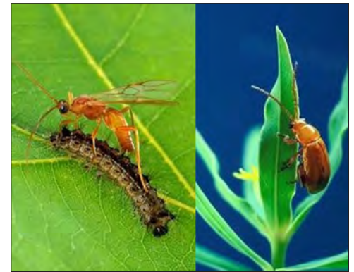
Wasp and fleas feeding are a method of bio-control.

Unfortunately, beneficial insects are susceptible to many pesticides. Use of insecticides can reduce beneficial insect populations, so choose and use these with care and only as needed to control pest populations.